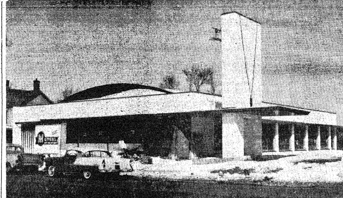
ALMOST READY: Pictured above is the new Mutual Supermarket soon to be opened on Rahway Avenue for the convenience of Woodbridge area shoppers. The new market is equipped with all the latest scientific devices for the shoppers' convenience: over-wide aisles for traffic-free travel, the most modern methods for pre-packed meats and produce are among a few of the innovations mentioned by Carl Millman, President of the Mutual organization. There is also parking facilities for over 400 cars on the Mutual Super Market parking area.